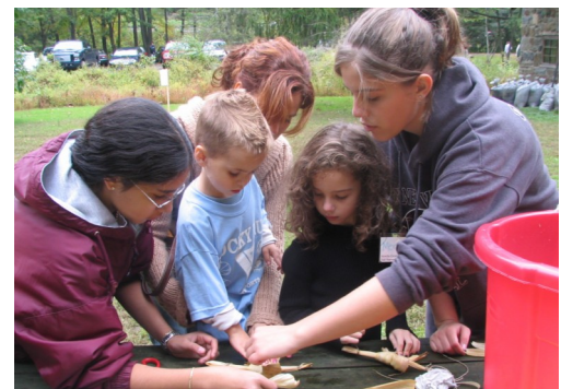
Top to bottom (Left to Right): Volunteers helping with colonial games, cleaning the mill stones, providing mill tours, working in the blacksmith shop, and helping children with craft activities.